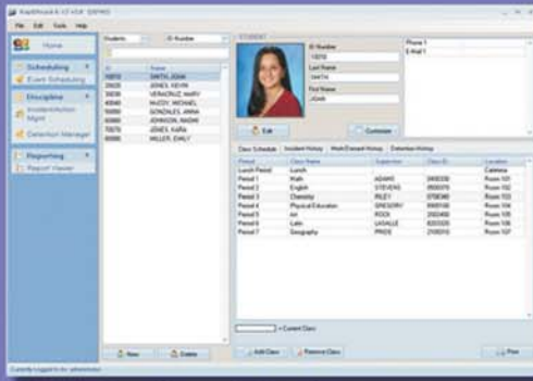
View Student Schedule