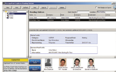
SecureView gives lobby staff a visual alert to undesirable visitors

SecureView is also very flexible. It lets you designate locations for each of your own watchlists, select colors and texts for each level of emergency alert, and author your own security policies and procedures.