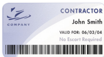
Prints inexpensive disposable bar-coded paper badges

With PassagePoint AC Integration Add-On, there is no delay in activating or deactivating access cards. Everything is immediate, including reports generated by PassagePoint and your access control system. It lets you program badges to de-activate on specified dates and times. This eliminates the risk of stolen or missing cards, and makes it safer to provide temporary access to employees or visitors who lose or forget their cards. And with random access numbering logic, PassagePoint Access Control virtually eliminates fraudulent badge numbers and accidental duplication.