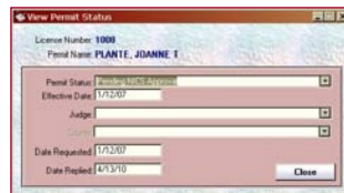
Application status - NICS.

Integrated permit card designer included!