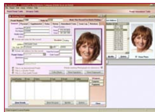
Complete record management.